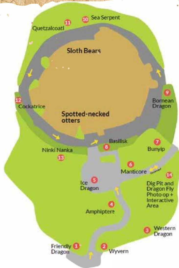
15 Komodo Dragon