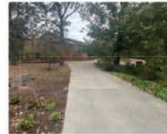
NEAR KOMODO DRAGON EXHIBIT SITE