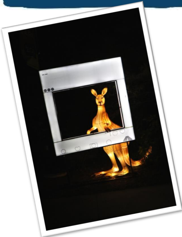
Photo Opportunity Area