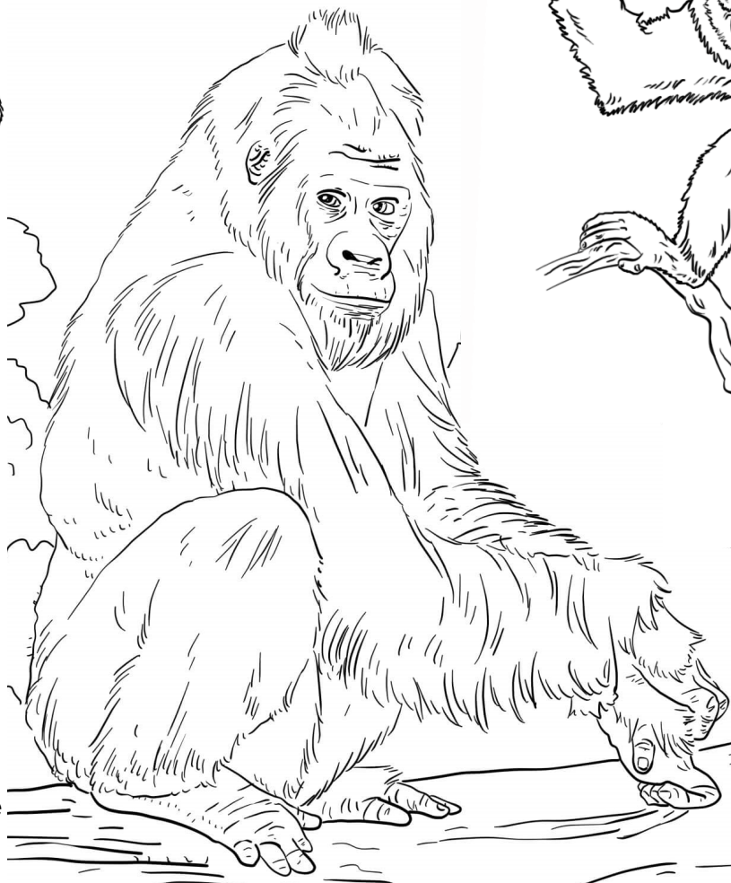
Great Ape (Gorilla)