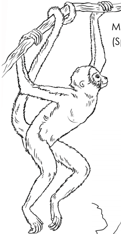
Monkey (Spider Monkey)

Look closely as you color three different primates and look for similarities and differences.